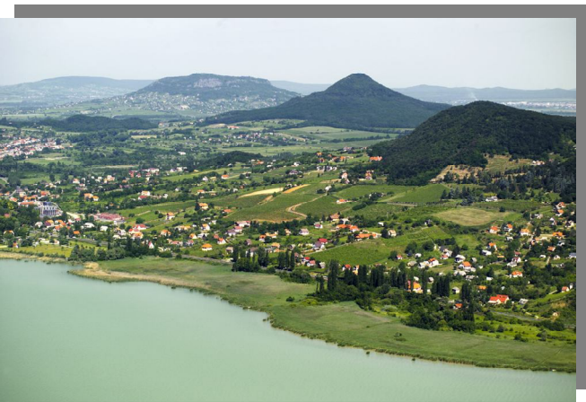
1. Lake Balaton – Hills of Káli Basin

And there is something else that keeps bringing visitors back to us - the legendary Hungarian hospitality.