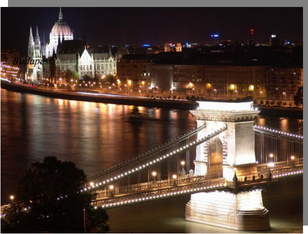
2. Budapest –The lights of Parliament and Chain Bridge